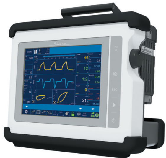
FALCO 202 EVO TRANSPORT