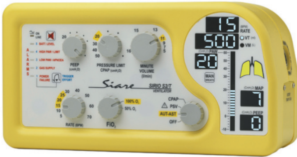
SIRIO S2T with Spirometry