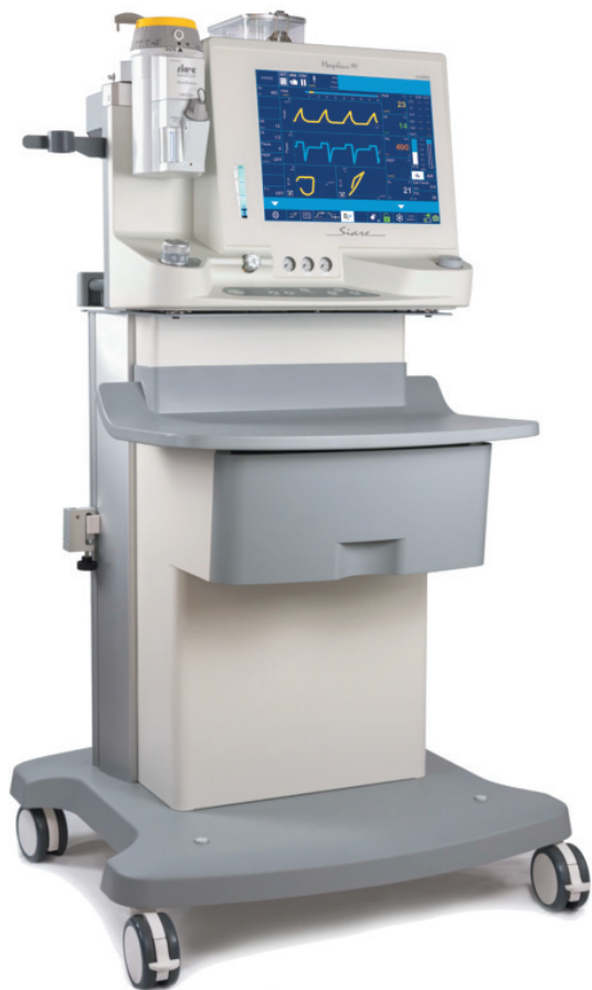
MORPHEUS ND HYBRID