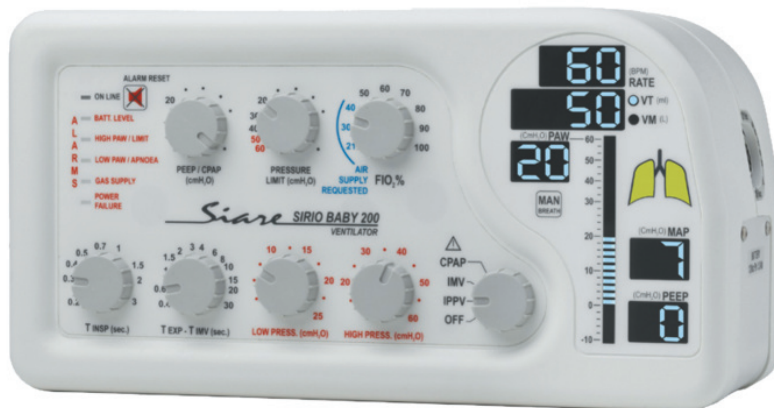
SIRIO BABY 200 MRI