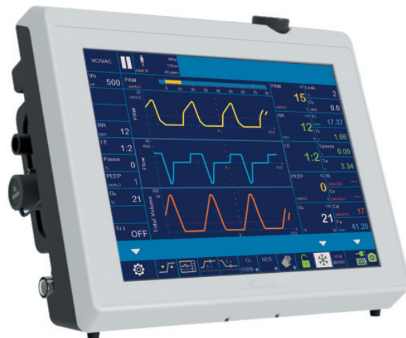
ARIA 150 C

We covers different situations, from intensive to critical care transport.