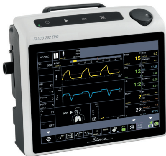
FALCO 202 EVO