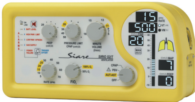
SIRIO S2T MRI