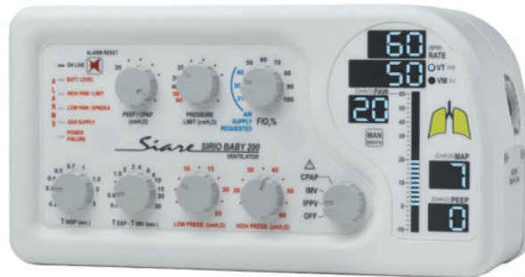
SIRIO BABY 200