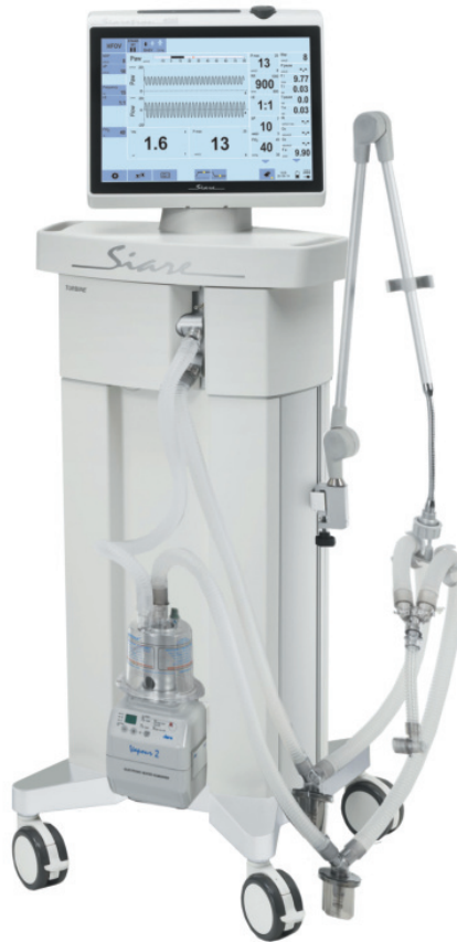
SIARETRON 4000 15" HFOV

In the field of respiratory assistance, we offer high standards technology products that significantly improve the patient's life.